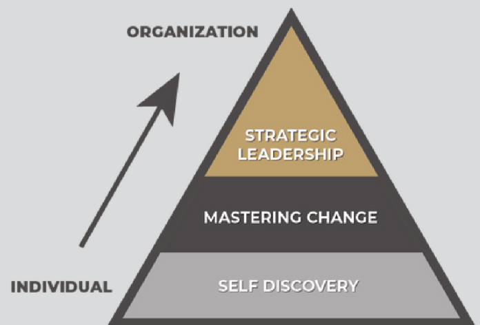
LEVELS OF TRANSFORMATIONAL LEADERSHIP